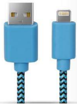
DC-015 ● ● ● ● ● USB DATA CABLE, MOLDING TYPE, NYLON BRAIDED A: 8PIN B: MICRO USB C: TYPE C