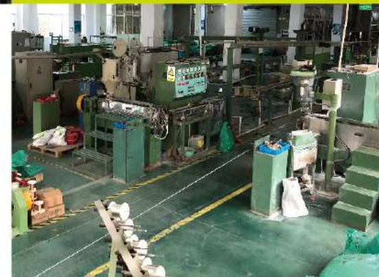
CABLE DRAWING WORKSHOP