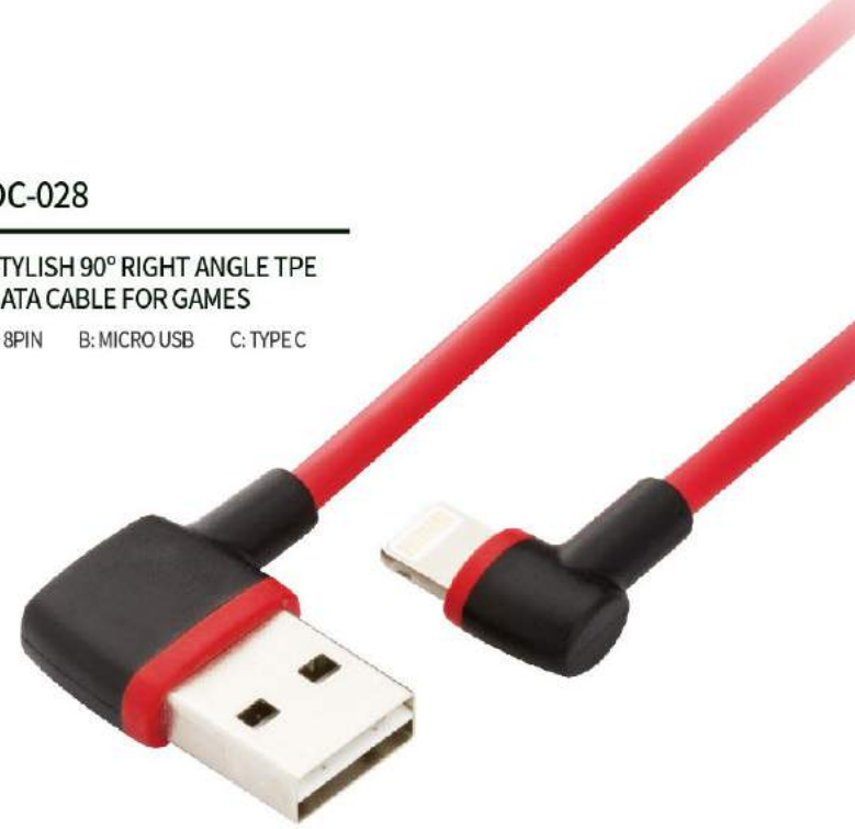
DC-028 STYLISH 90° RIGHT ANGLE TPE DATA CABLE FOR GAMES A: 8PIN B: MICRO USB C: TYPE C