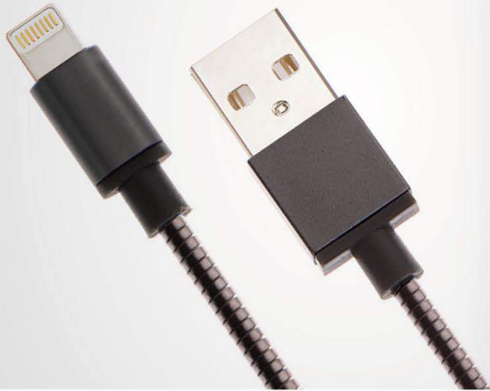
DC-005 ● ● ● ● ● USB DATA CABLE, METAL PLUG, STAINLESS STEEL JACKET A: 8PIN B: MICRO USB C: TYPE C