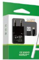
GIFT BOX-23 FOR HOME CHARGER COMBO