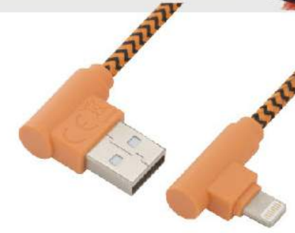
DC-026 RIGHT ANGLE USB DATA CABLE, PVC MOLDING TYPE, NYLON BRAIDED A: 8PIN B: MICRO USB C: TYPE C