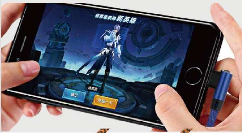
DC-058 ● ● ● ● STYLISH 90° RIGHT ANGLE BRAIDED DATA CABLE FOR GAMES A: 8PIN B: MICRO USB C: TYPE C