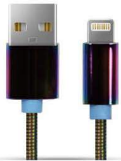
DC-091 ● ● ● ● ● USB DATA CABLE, METAL PLUG, COLORFUL STAINLESS STEEL JACKET A: 8PIN B: MICRO USB C: TYPE C