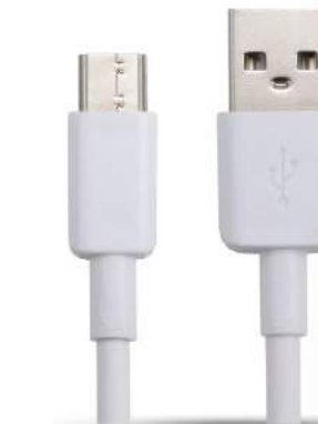
DC-101 5A SUPER FAST CHARGE CABLE FOR HUAWEI