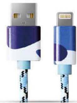
DC-094 ● ● ● ● ● USB DATA CABLE WITH DOUBLE COLOR PLUG, NYLON BRAIDED A: 8PIN B: MICRO USB C: TYPE C