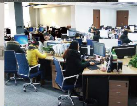
OFFICE OF SALES DEPARTMENT