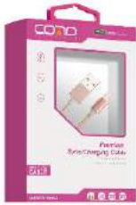
GIFT BOX-17 FOR USB DATA CABLE