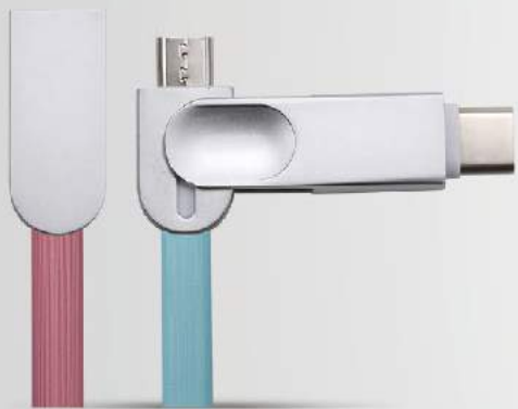
DC-089 ● ● 2 IN 1 USB DATA CABLE, FLAT DOUBLE COLOR A: 8PIN B: MICRO USB