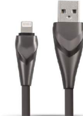
DC-100 ● ● USB DATA CABLE, ZINC AOLLY PLUG A: 8PIN B: MICRO USB C: TYPE C