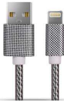
DC-093 ● ● ● ● ● LATTICE USB DATA CABLE, METAL PLUG, STAINLESS STEEL JACKET A: 8PIN B: MICRO USB C: TYPE C