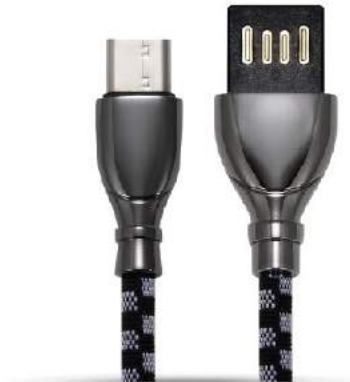
DC-099 ● ● ● USB DATA CABLE, ZINC ALLOY PLUG, SQUARE PATTERN, NYLON BRAIDED A: 8PIN B: MICRO USB C: TYPE C