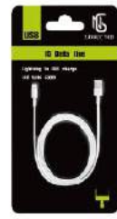
BLISTER PACK-5 HOT SEALING