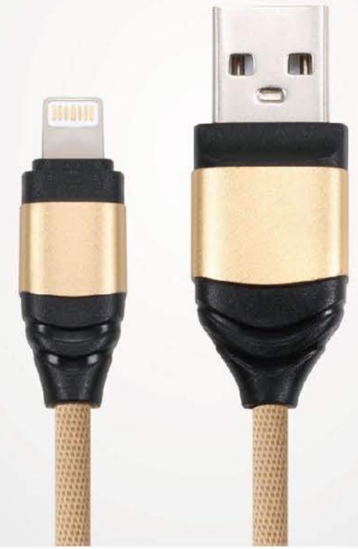
DC-096 ● ● ● ● ● USB DATA CABLE, METAL PLUG, NYLON BRAIDED, INNER-MOULD PROCESS A: 8PIN B: MICRO USB C: TYPE C