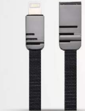
DC-097 ● ● ● ● ● ● USB DATA CABLE, METAL PLUG, COMP PRIVATE MOLD A: 8PIN B: MICRO USB C: TYPE C