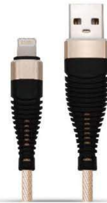
DC-102 ● ● ● ● ● USB DATA CABLE, METAL PLUG, NYLON BRAIDED, WITH STRENGTHENED SR A: 8PIN B: MICRO USB C: TYPE C