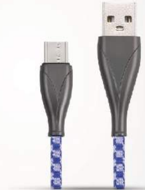
DC-098 ● ● ● ● USB DATA CABLE, ZINC ALLOY PLUG, SQUARE PATTERN, NYLON BRAIDED A: 8PIN B: MICRO USB C: TYPE C