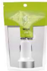
ZIPLOCK BAG WITH PRINTING