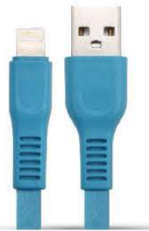
DC-085 ● ● ● ● ● FLAT USB DATA CABLE, TPE COAT A: 8PIN B: MICRO USB C: TYPE C