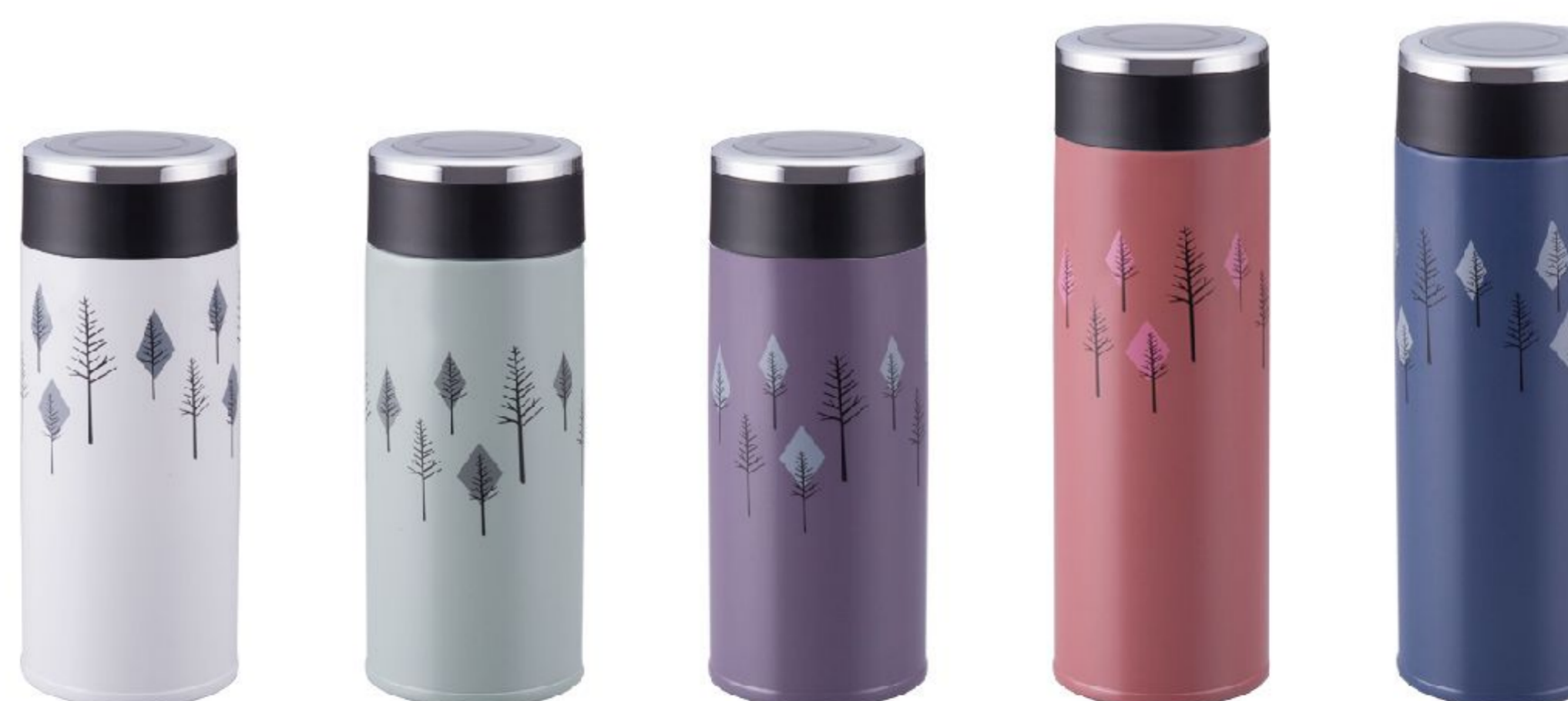
ITEM NO.:NYQ2-34/43 Capacity:340/430ml Specification(cm): 7.1×7.1×17.5/20.7cm