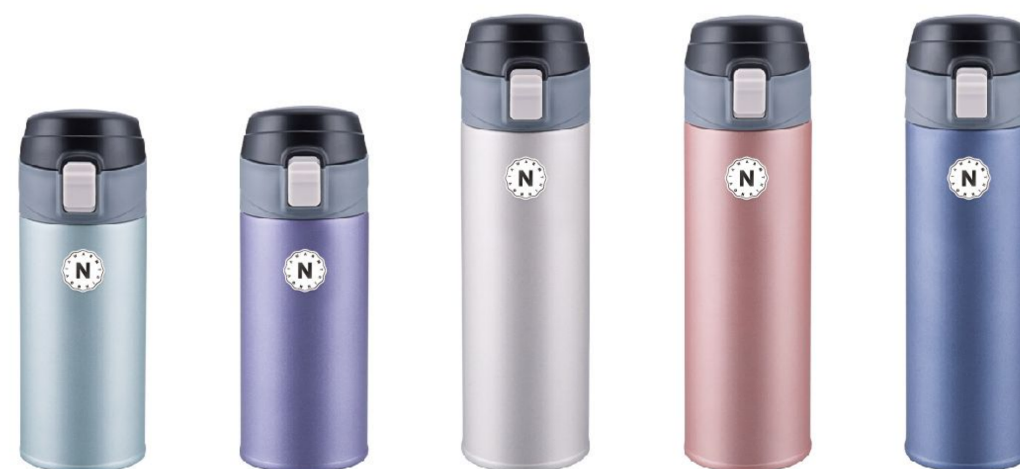
ITEM NO.:NYQ6-35B/48B Capacity:350/480ml Specification(cm): 7×7×16/24cm