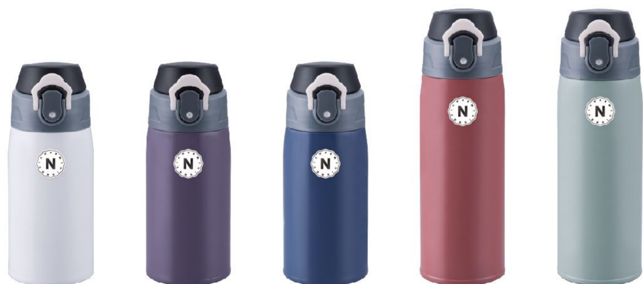
ITEM NO.:NYQ3-35B/48B Capacity:350/480ml Specification(cm): 7×7×16/21cm

Super clean finished process for less stain and odor; Vacuum insulation structure gives you hot and cold beverage longer; Compact and light weight to store into the bag.