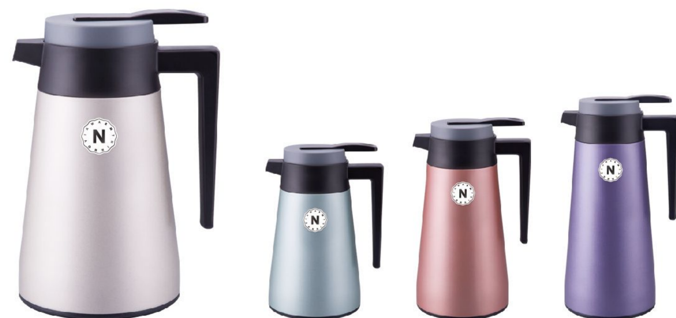
ITEM NO.:NWY-TYC1.0L / 1.3L / 1.6L Capacity:1000ml / 1300ml /1600ml Specification(cm): 17×13×24cm / 17×13×26.8cm / 17×13×30.2cm