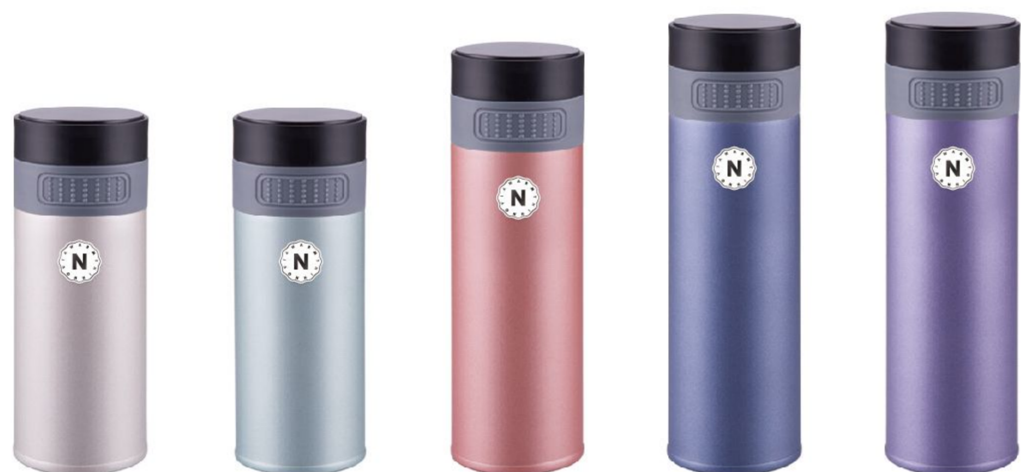
ITEM NO.:NYQ5-20A/26A/30A Capacity:200/260/300ml Specification(cm): 6.6×6.6×17/19/21.5cm