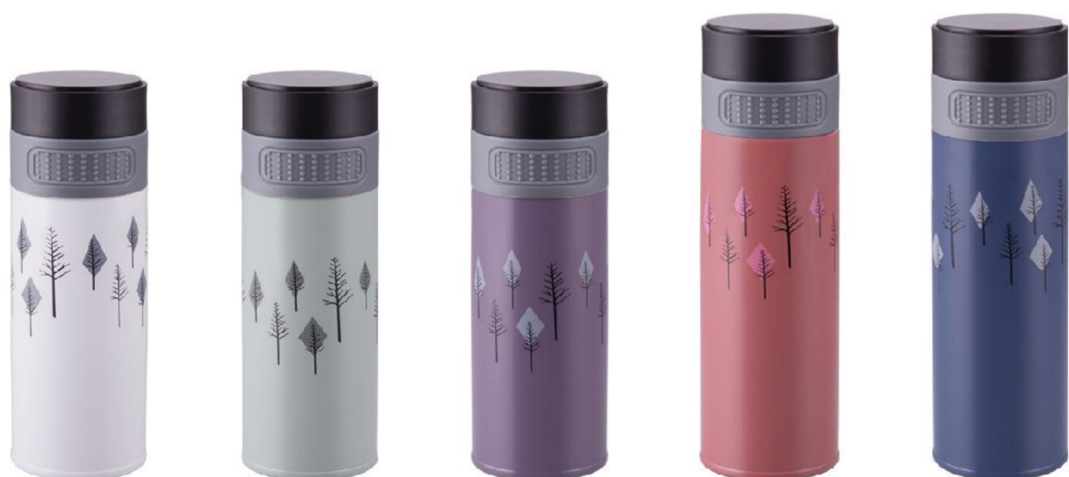
ITEM NO.:NYQ6-35C/48C Capacity:350/480ml Specification(cm): 7.1×7.1×18.5/22.8cm