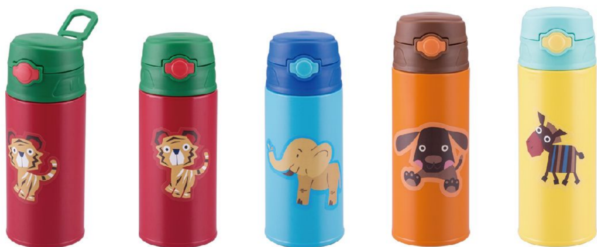
ITEM NO.:NVE1-35/42 Capacity:350/420ml Specification(cm): 7.2×7.2×19/21cm