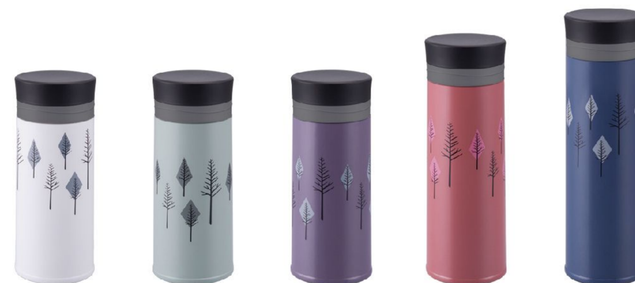
ITEM NO.:NYQ1-20B/26B/30B Capacity:200/260/300ml Specification(cm): 6.6×6.6×15/17.8/19.6cm