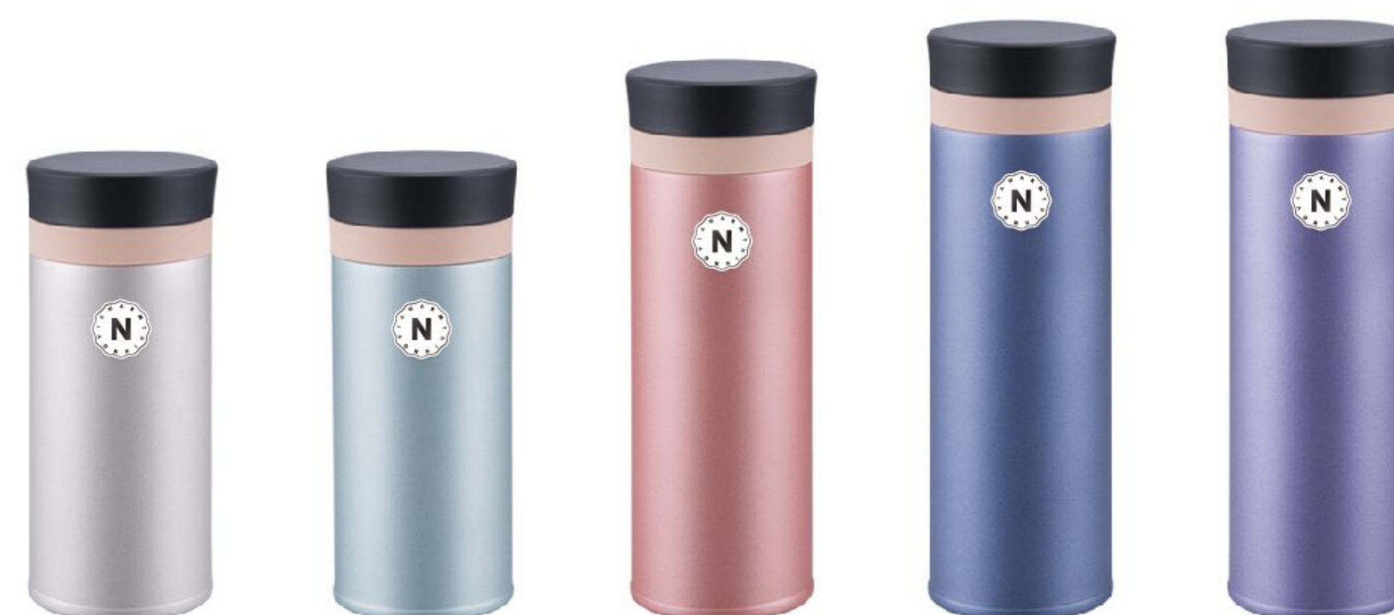
ITEM NO.:NYQ1-20A/26A/30A Capacity:200/260/300ml Specification(cm): 6.6×6.6×15/17.8/19.6cm