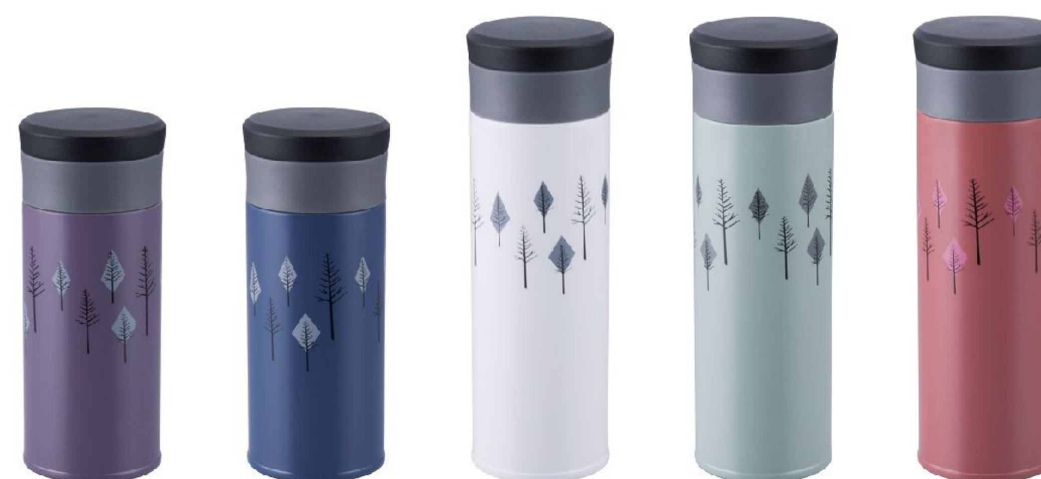
ITEM NO.:NYQ6-35D/48D Capacity:350/480ml Specification(cm): 7×7×17.5/21.8cm