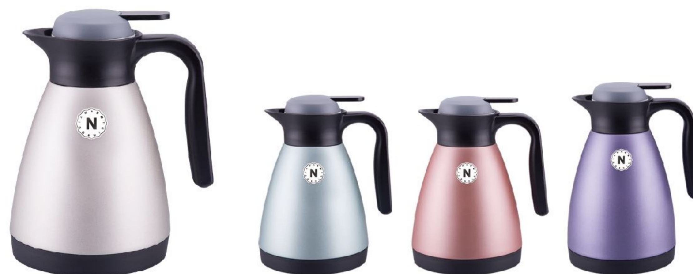
ITEM NO.:NWY-CXC0.8L / 1.0L Capacity:800ml / 1000ml Specification(cm): 16×14×21cm / 16×14×23cm

Timeless.Natural.Enduring These principles guide the development of every NOVIA brand product. Products that help you savor every moment with a cup of hot coffee.