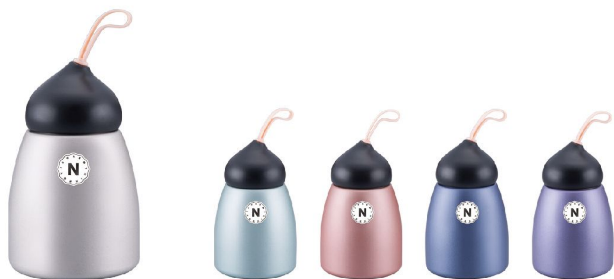
ITEM NO.:NYE2-26 Capacity:260ml Specification(cm): 8.2×8.2×13cm

Super clean finished process for less stain and odor; Vacuum insulation structure gives you hot and cold beverage longer; Compact and light weight to store into the bag.