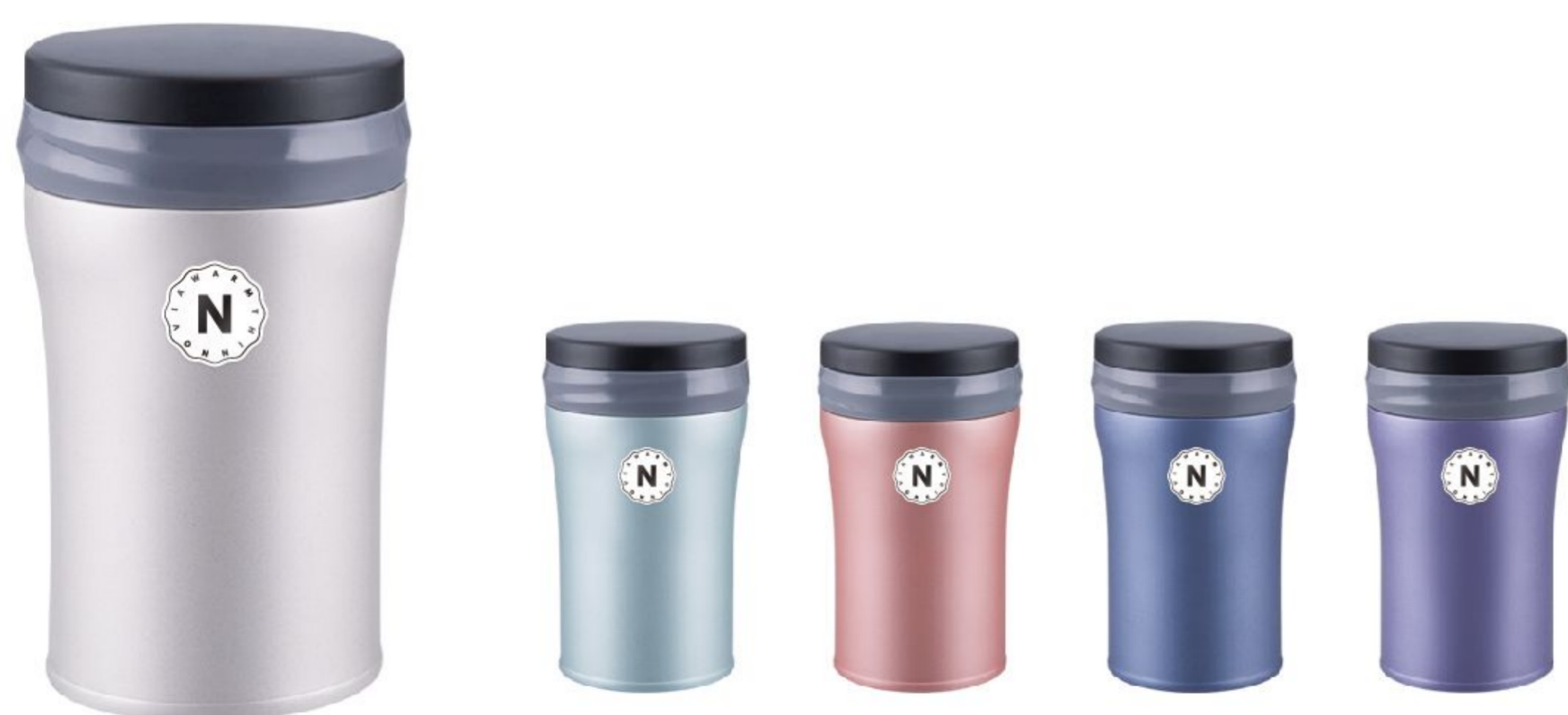
ITEM NO.:NYF2-50 Capacity:500ml Specification(cm): 11×11×17cm