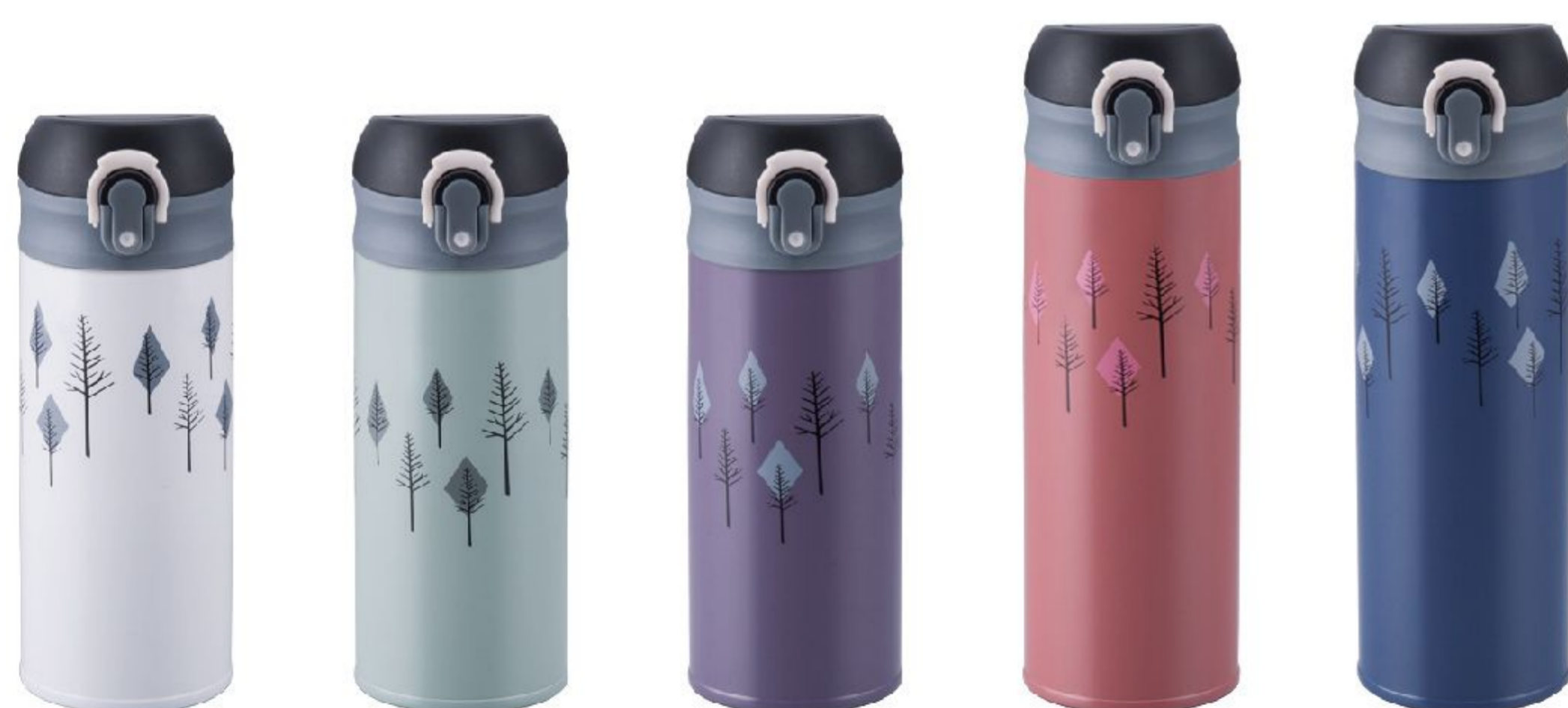
ITEM NO.:NYQ6-35A/48A Capacity:350/480ml Specification(cm): 7.1×7.1×14.6/22.8cm