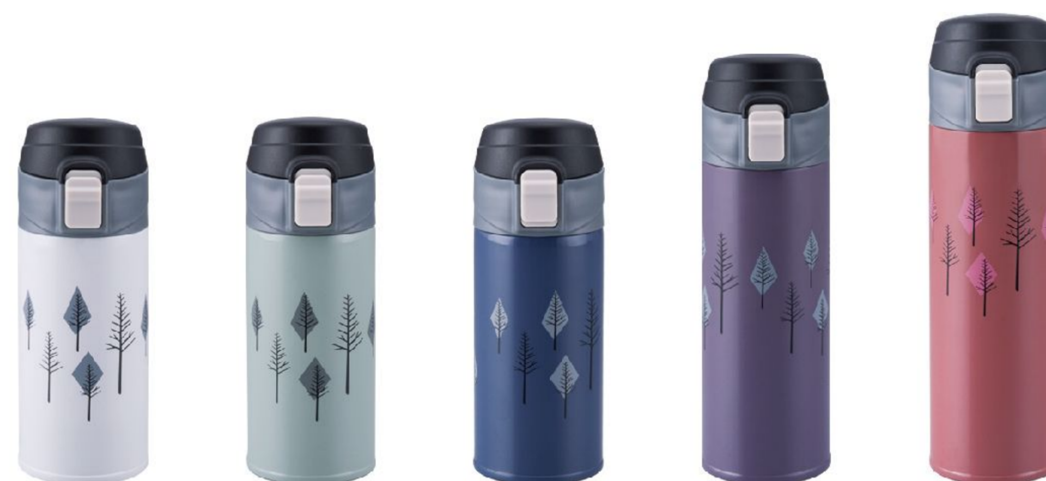
ITEM NO.:NYQ5-20B/26B/30B Capacity:200/260/300ml Specification(cm): 6.8×6.8×17.5/20.5/22.5cm