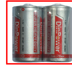
R14/UM2/SIZE C/1.5V 2PCS/PK