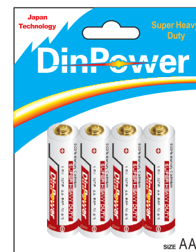
R6/SUM3/SIZE AA/1.5V 4PCS/PK