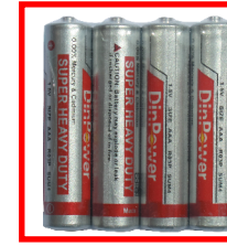
R03/UM4/SIZE AAA/1.5V 4PCS/PK