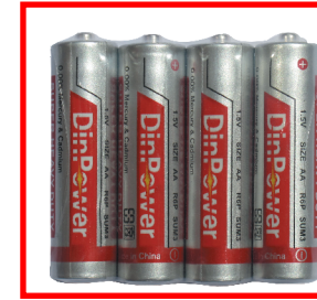
R6/UM3/SIZE AA/1.5V 4PCS/PK