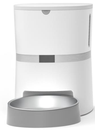
S36 & A36