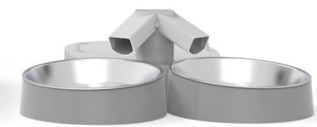
A9 Two-way splitter