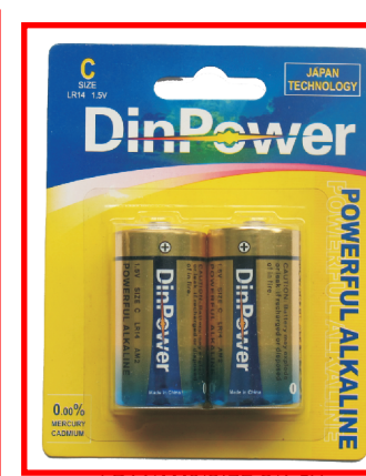
LR14/AM2/SIZE C/1.5V 2PCS/PK