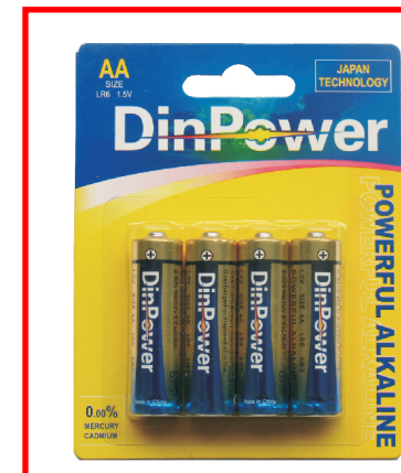
LR6/AM3/SIZE AA/1.5V 4PCS/PK