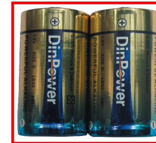
LR20/AM1/SIZE D/1.5V 2PCS/PK