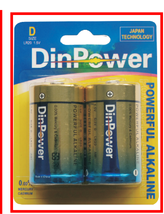
LR20/AM1/SIZE D/1.5V 2PCS/PK