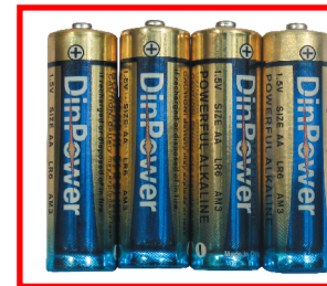
LR6/AM3/SIZE AA/1.5V 4PCS/PK