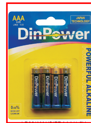
LR03/AM4/SIZE AAA/1.5V 4PCS/PK