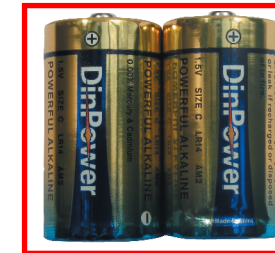
LR14/AM2/SIZE C/1.5V 2PCS/PK