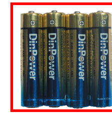
LR03/AM4/SIZE AAA/1.5V 4PCS/PK